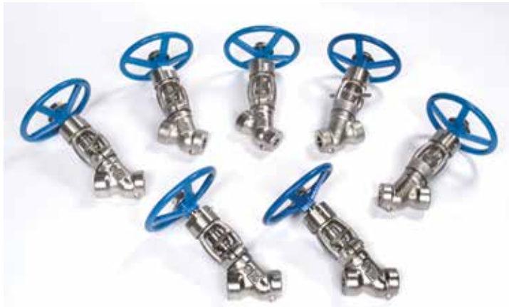
Clampseal Urea Globe Valves