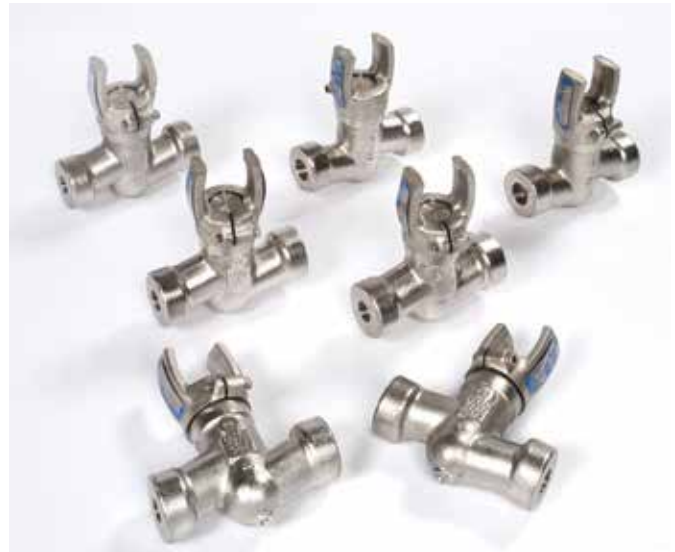
Clampseal Urea Check Valves