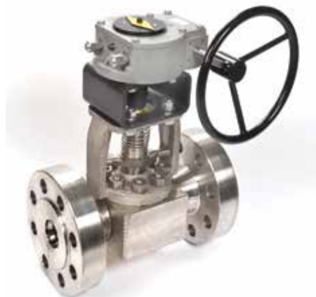
Camseal Urea Ball Valves