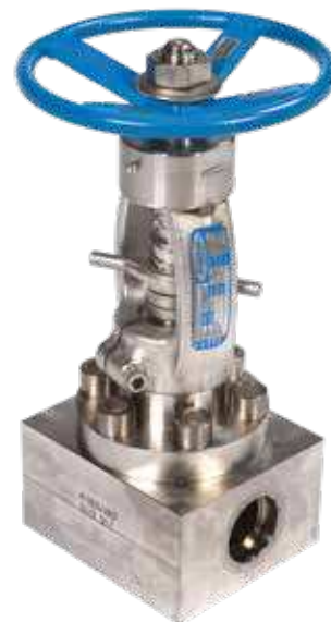
Urea Gate Valves