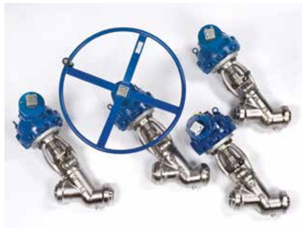
Urea Actuated Valves